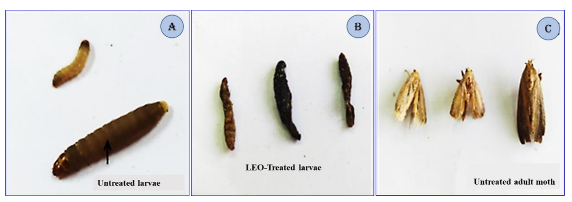
Figure (3): G.mellonella treated with nanocapsules of lemongrass oil (LEO). A, Weight reduction of treated larva with the highest concentration used (640ppm). B, Malformations in treated larvae with conc. 80, 160 and 320 ppm. C, Morphological deformations in adults developed from treated larvae nanocapsules with conc. 80 and 160 ppm.

Data are in mean \pm SE, Mean of three replicates, each set up with 50 larvae. Values followed by the same letter per column are not significantly different at p \leq 0.05 according to Duncan Multiple tests.