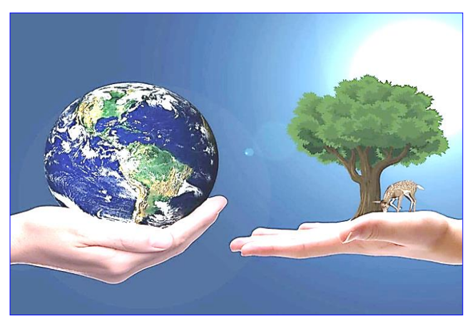
Figure (3): According to a report by Stockholm (NordSIP) in 2019, climate change has wide-ranging impacts on biodiversity across all levels of life on Earth, <a href="https://nordsip.com/2022/01/31/where-biodiversity-protection-and-decarbonization-meet/">https://nordsip.com/2022/01/31/where-biodiversity-protection-and-decarbonization-meet/</a>).