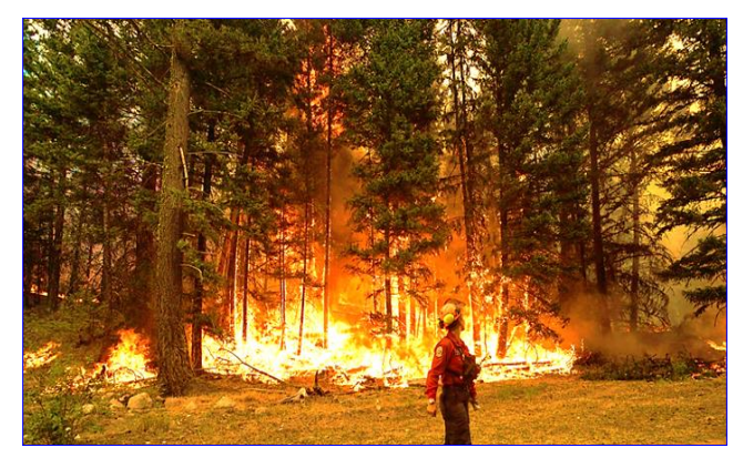
Photo (6): A member of the B.C. Wildfire Service watches a planned ignition on the Ross Moore Lake fire in Kamloops, British Columbia, Canada, in July.

Five persons lost their lives as a result of severe flash flooding that slammed the Philadelphia suburbs and swamped highways. Heavy flooding earlier this month also caused road and building damage in Vermont, trapping many inside their houses as shown in photo (7), tens of millions of people nationwide were under a flood watch, while in the past year, devastation floods in nations like South Korea, Pakistan, and Turkey has caused millions of people to be uprooted and forced to evacuate (Li Zhou, 2023).