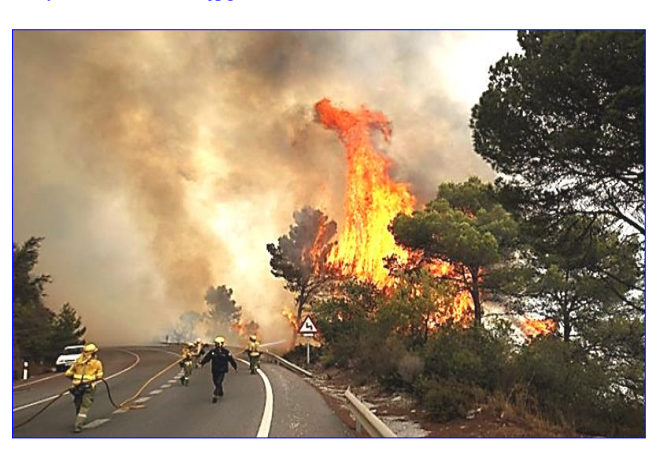
Photo (3): Wildfire in Spain. Sergio Torres, CC BY-SA 4.0 (https://catalyst.cm/stories-new/2023/6/28/5-wildfires-around-the-world-in-2023).