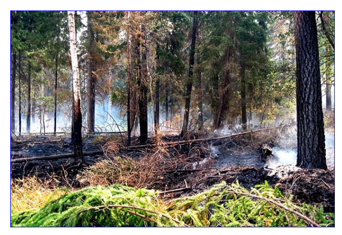
Photo (4): Wildfire damages in Russia.