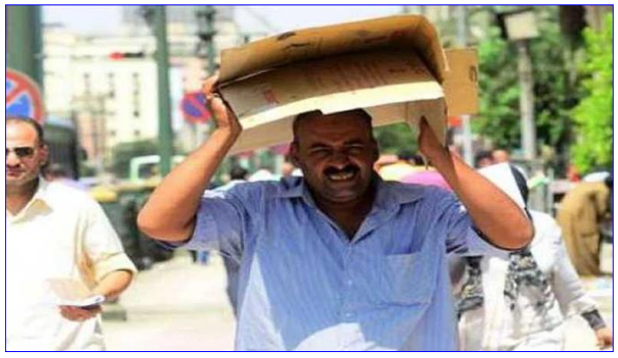
Photo (1): The extreme heat experienced in Egypt during the month of July has proven to be unbearable for a significant number of individuals (<a href="https://www.almasryalyoum.com/news/details/2-947781">https://www.almasryalyoum.com/news/details/2-947781</a>).

The average temperature in Egypt has been rising faster over the past 20 years, which has significantly increased the energy needed for cooling during the summer. A recent heat wave has caused the perceived temperatures in much of Egypt to exceed 40 degrees Celsius, as evidenced by Photo (1). According to climate estimates, Egypt will warm faster than the rest of the globe by 2100 and suffer a considerable rise in electricity demand as a result of more frequent extreme heat events, urbanization, and population expansion. Increased environmental temperatures could put pressure on natural gas, solar PV, and wind power generation, reducing generation efficiency. A more resilient energy system is required given the rising demand for electricity for cooling and declining generation efficiency (IEA, 2023).