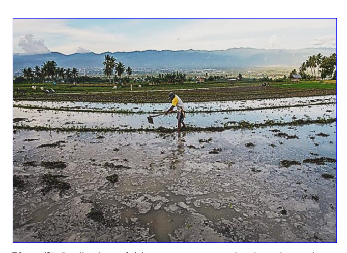
Photo (8): Implications of rising temperatures on rice-dependent regions: Assessing the impact on global food security. More than half the world relies on rice as a primary food source.

Ecosystems and biodiversity are under constant and escalating threat from climate change. Climate change has an impact on certain species, their interactions with other living things, and their habitats, which changes how ecosystems work and what products and services are produced by natural systems for society. Human societies can more accurately predict these changes and make the appropriate adjustments if they have a better understanding of the direction and size of ecological reactions (Eissa et al. , 2023). A significant ecological problem is comprehending, anticipating, and mitigating climate change. In addition to affecting various species differently, climate change will modify species interactions, community structure, plant phenology, biodiversity, and